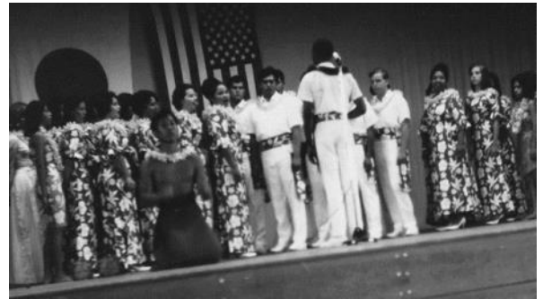
Members from County of Hawai'i visited Oshima Island in 1962.

This year marks the 60th anniversary, and a group of students from Hilo HS Japanese class and Oshima HS have been meeting and building relationships via zoom since February 2021. Students learned about each other's islands, school lives, interests, etc. Hilo HS Japanese class students created a video to introduce Oshima Island and our relationships to their peers at their school's KVIKS morning bulletin news: https://youtu.be/HGyYJeaOOw?t=261 or scan QR code to watch the news.