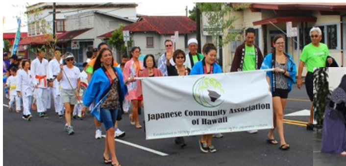
Parade marchers included: JCAH, Hilo Hongwanji Judo Club, Fukushima Kenjinkai, Hilo Kobukan Kendo Club and other individuals.