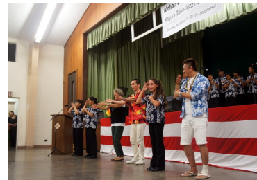
Guests from Buzen tried Hula with Waiakea Intermediate School Ukulele Band.