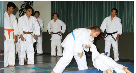
Hilo Hongwanji Judo Club