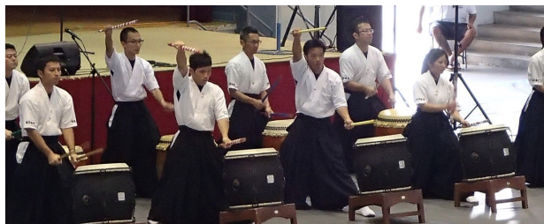
Left: Japanese Self-Defense Training Ship officers played Shozui Daiko at Civic Auditorium. Right: Visitors were allowed on board until the last minutes before departure.