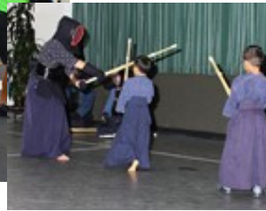
Hilo Kobukan Kendo Club