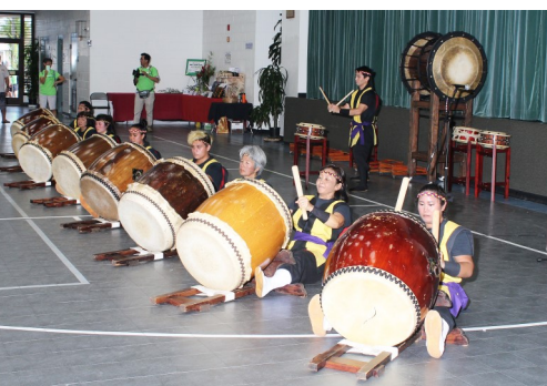
Left: Hui Okinawa Kobudo Taiko. Right: Food concession by Honpa Hongwanji Hilo Betsuin Buddhist Women's Association.