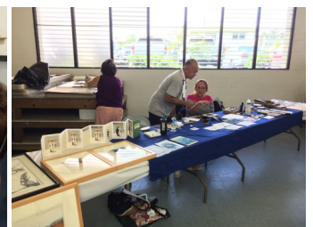
Left: Kumihimo, Right: Mokuhanga or Woodblock printing