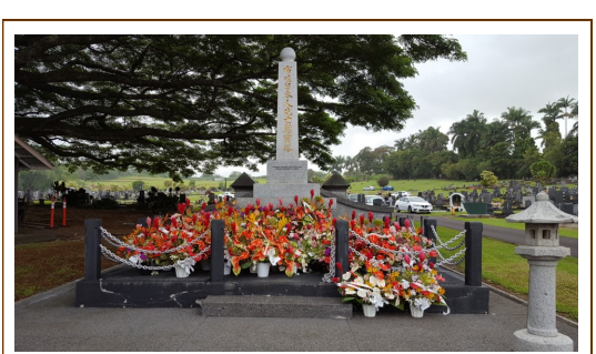
2017 Bouquets of flowers at the Ireito Monument.

Guests from County's Sister City, Sumoto, Fukuoka Kenjinkai guests from Miyako Town, and students and instructors from the Kanto Gakuin University of Kanagawa prefecture also attended the event.