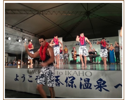
Kane Hula Halau “Ka Leo O Laka I Ka Hikina O Ka La” performs surfer hula at the 18th Annual Ikaho Merrie Monarch Hula Festival.