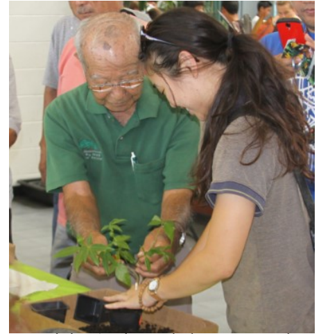
Bonsai time! The Mokuhonua Bonsai club once again helped many with starter bonsai to take home!

This festival is special because families celebrate with their children. Every child brings home many Japanese "gifts" that they made, like chigiri-e, origami, pinwheels, Boy's Day hats, kites, woodcut prints, their name written in Japanese and tasty treats like Takoyaki, Mochi and Musubi.