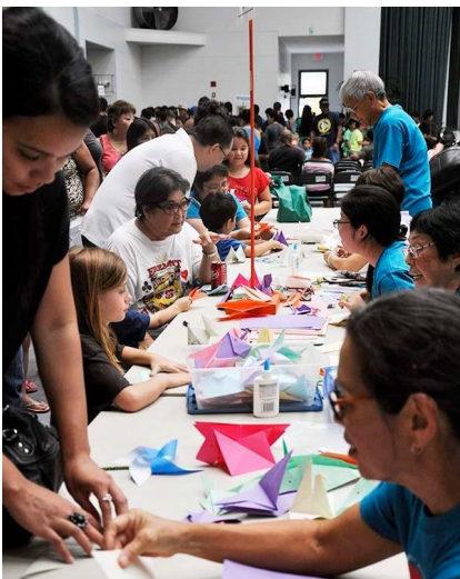
Everyone loves to learn the art of folding paper— Origami.