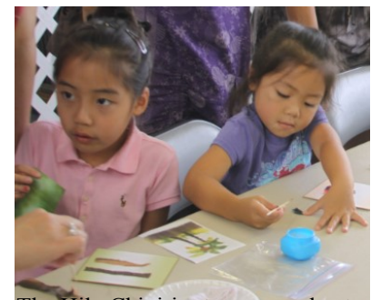
The Hilo Chigiri-e team were kept busy teaching the art of tearing paper to children of all ages.