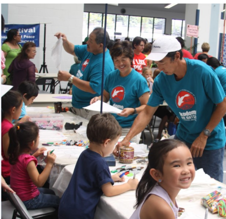
Takoage (kite making) and later flying the Kite...oh what fun!