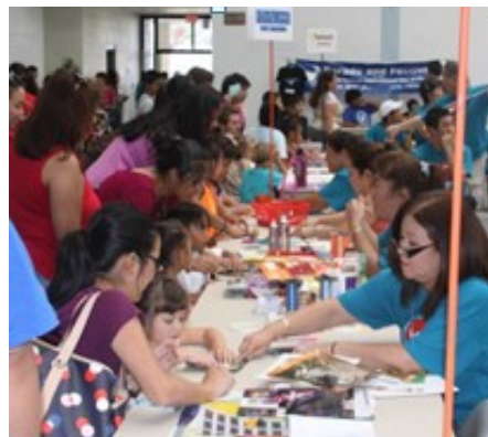
Hakozukuri, paper box making, using Recycled paper...Mottainai!