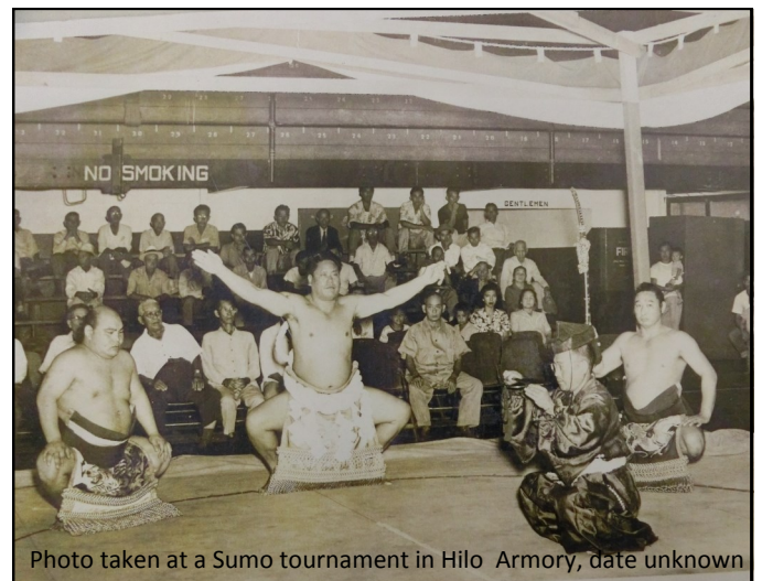
Photo taken at a Sumo tournament in Hilo Armory, date unknown