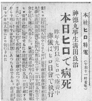
(Left) An obituary on Nippu Jiji published on January 21, 1927 reads: