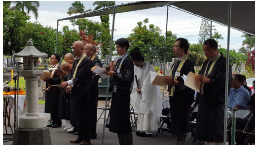
2015 Ireito Memorial Service (file picture)

The Annual Ireito Memorial Service is one of our major events to thank and remember our Japanese ancestors, the Issei immigrants, who established their legacy through hard work and sacrifice. In addition to the memorial services, we pay respect at the graves of two Japanese training ship cadets who lost their lives during their voyage to Hawaii. The event is open to public.