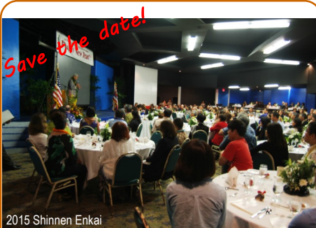
2015 Shinnen Enkai